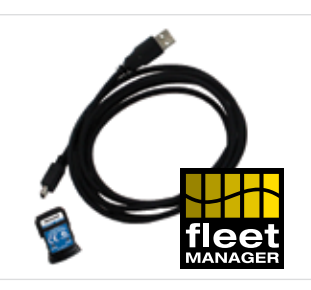
IR Connectivity Kit GA-USB1-IR Use for data download and instrument set-up options