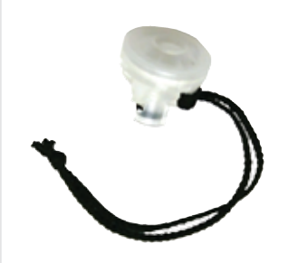
Auxiliary Pump Filter M5-AF-K2 / M5-AF-K2-100 For high dust environments; available in kits of 5 or 100