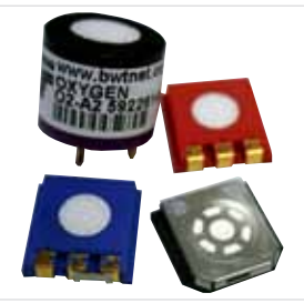
Replacement Sensors SR-W-MP75C / SR-X10-C1 / SR-H-MC / SR-M-MC