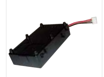
Replacement Battery Kit XT-BAT-K1