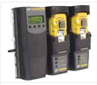
MicroDock II - Base Station and GasAlertMax XT II Docking Module DOCK2-2-1C1M-00-G DOCK2-2-1M-00-G