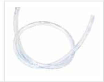
Sampling Hoses HOSE1-10 / HOSE1-20 / HOSE1-75 / HOSE2-10 / HOSE2-20 / HOSE2-75 / HOSE2-130